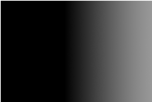
No gamma (gamma level=0)